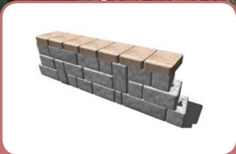
RANDOM VERTICAL WALL