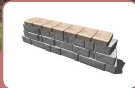
SHADOW VERTICAL WALL