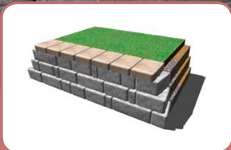
VERTICAL RETAINING WALL