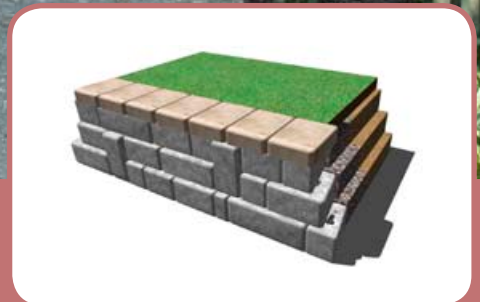
RANDOM RETAINING WALL