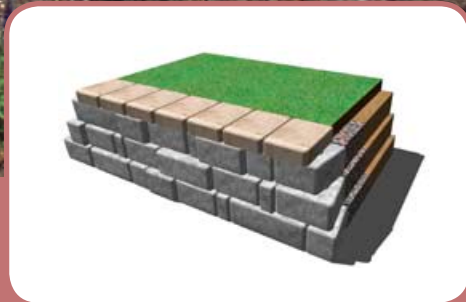
SHADOW RETAINING WALL